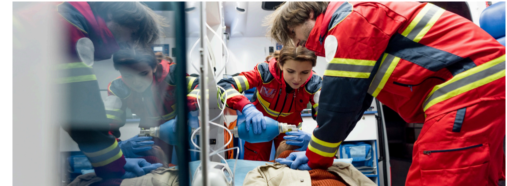
The redesigned Westonka High School will feature state-of-the-art EMS/EMT and Certified Nursing Assistant facilities, including an ambulance bay for training

"Additionally, almost all of the new vocational programs will lead to either a state or national certification, which represents the mastery of critical skills in these fields that employers are actively seeking," Femrite added.