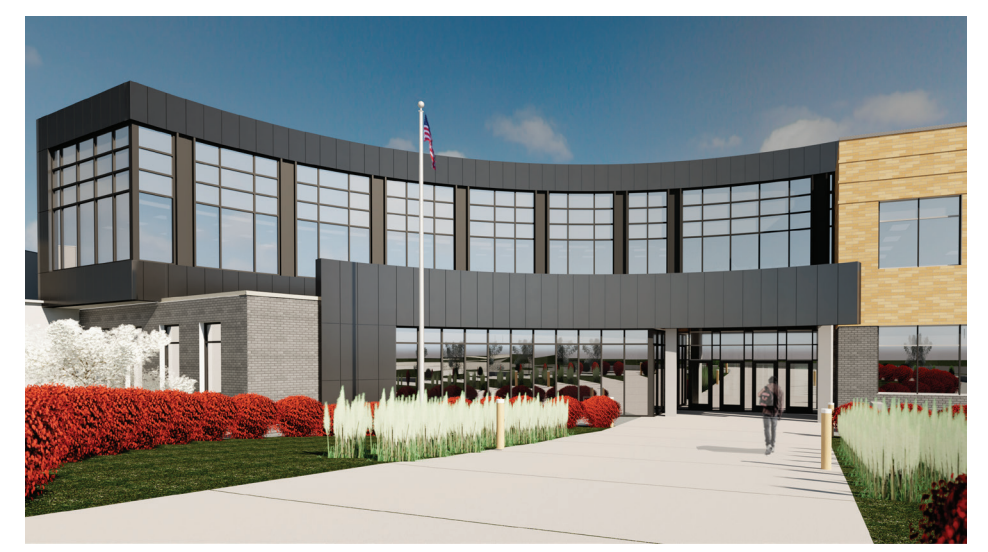
Wold Architects & Engineers rendering of high school north entrance

HIGH SCHOOL REDESIGN AND MIDDLE SCHOOL SECURITY IMPROVEMENTS ARE UP NEXT IN THE CONSTRUCTION TIMELINE